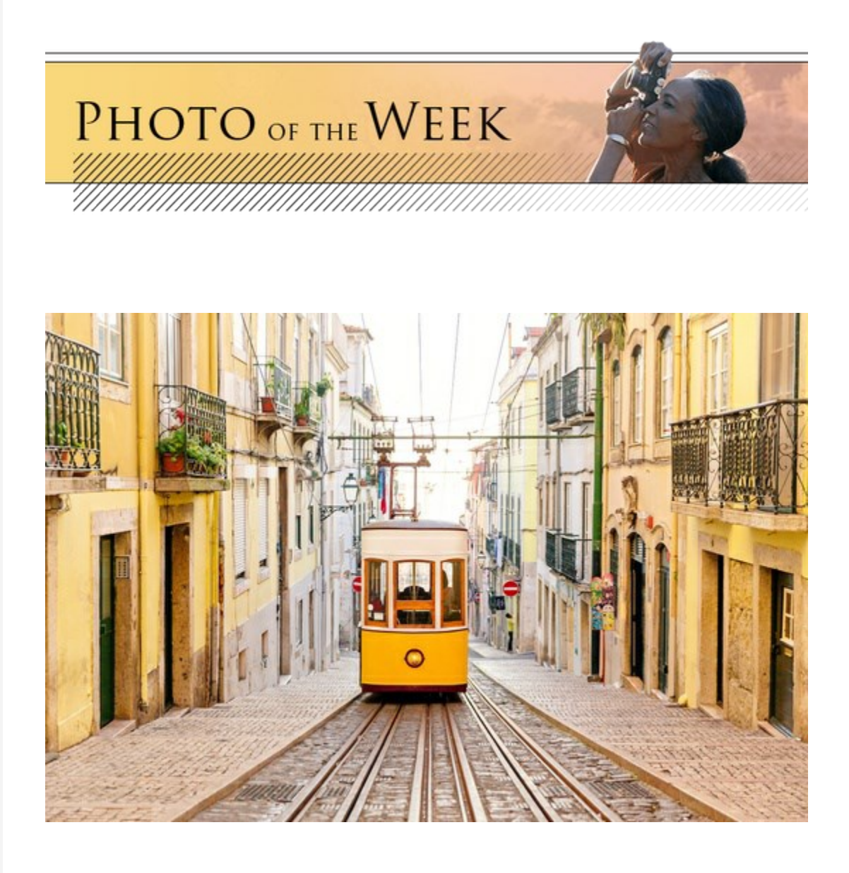
Elevador da Bica funicular in Lisbon, Portugal

Last week's riddle: You have 31 baseballs in a box, and 31 kids are lined up to get them. You give each kid a baseball, but in the end, one baseball remains in the box. How is this possible? Answer: When you give the last baseball away, you give it away within the box—that is, the 31st kid to get a baseball also gets the box.